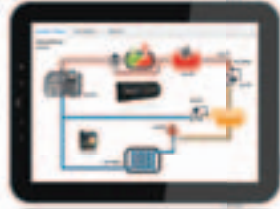
change the settings via remote