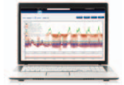
analyse unit performance