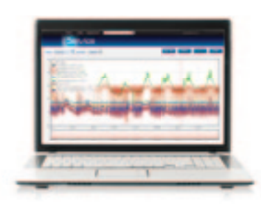
analyse site behaviour