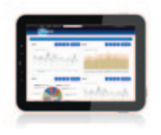
receive custom reports

Calculate the KPI of each unit and compare performance between systems: highlight the best configurations and optimise system operation quickly and easily.